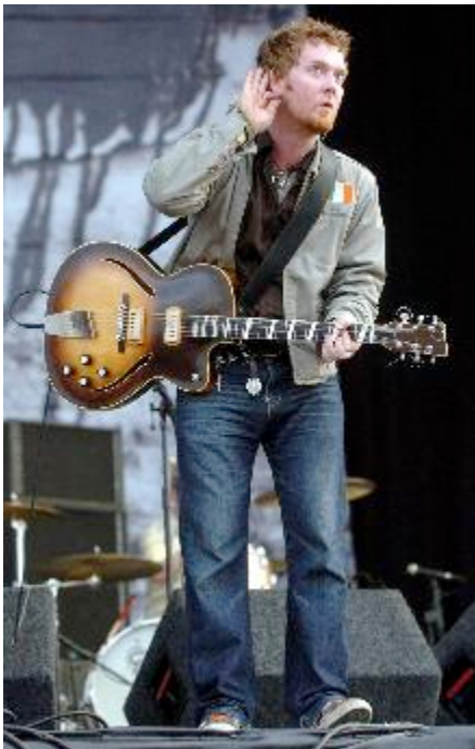
Glen Hansard, star of the hit Irish movie "Once" and lead singer of The Frames